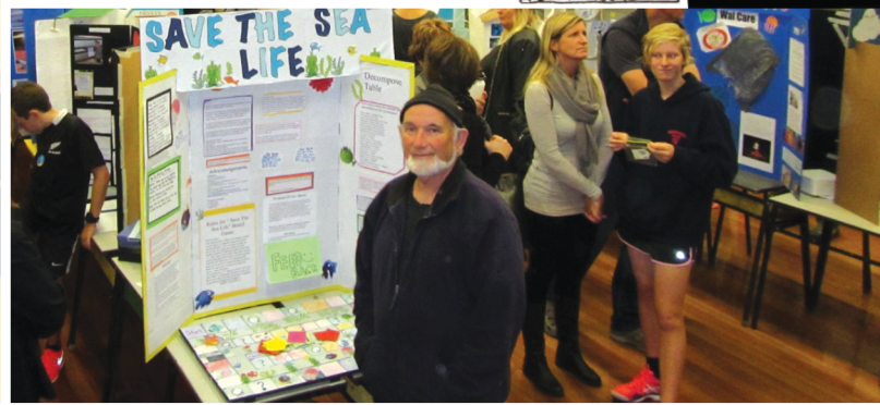
Dargaville & Districts News, June 12, 2013